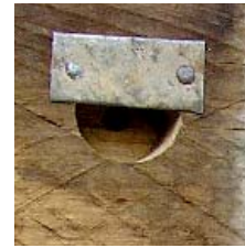
above: detailed view of reverse showing hanger and signature